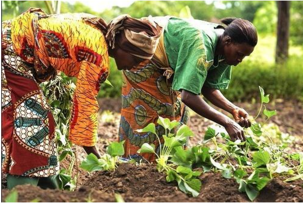
Plate 3: Female Farmers working on a Farm