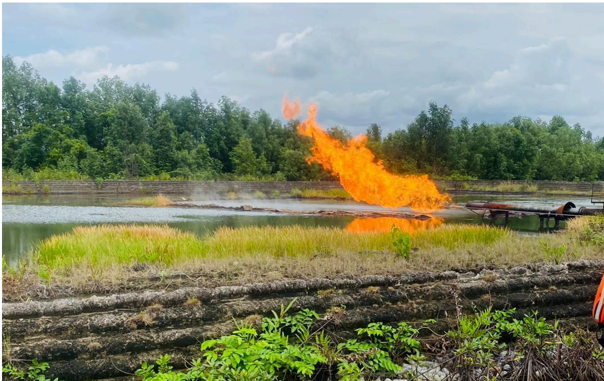
Plate 1: Gas flare in one of the fields in Niger-Delta now cleaned up with gas processing facility shown in plate 2

As one of the signatories to the Paris Agreement (PA), Nigeria recognises that the transition to low-emission development is indispensable for achieving sustainable economic growth through mitigation pathways that will reduce greenhouse gas (GHG) emissions and other social, economic, and environmental benefits. Also in alignment with the Paris Agreement, under Article 4.19, there is a call for all Parties to strive to formulate and communicate LT-LEDS; considering common but differentiated responsibilities and respective capabilities, the Federal Government of Nigeria decided to develop its LT-LEDS as part of the ambition to ensure a low-carbon future, with an initial focus on a Long-Term Vision to 2050 for the country. The vision provides a direction to all stakeholders for a well-managed transition to a low-carbon economy that grows existing and new sectors, creating new jobs and economic opportunities for the nation.