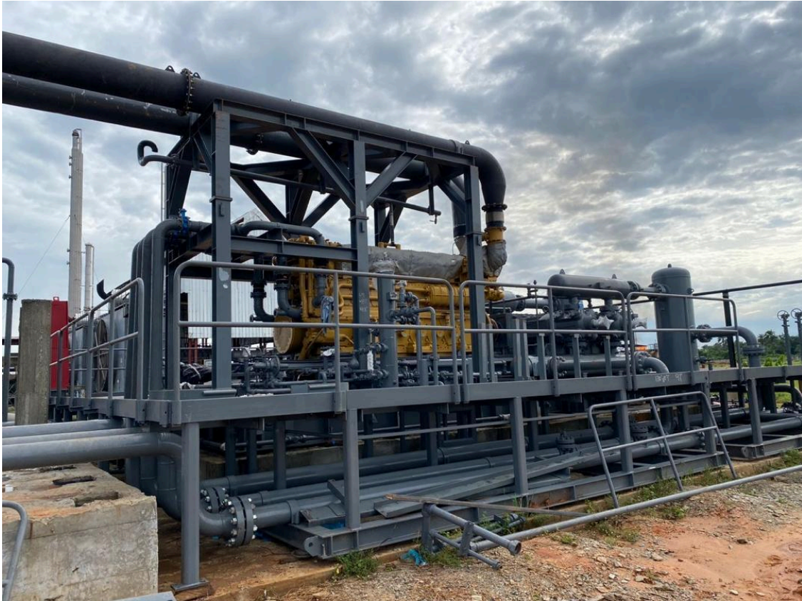
Plate 2: Gas Processing Facility helps to capture gas flare and process for domestic utilisation

annual cost of USD 10 billion, which is very high to accommodate in the country's budget; therefore, securing international climate finance is crucial to its success.