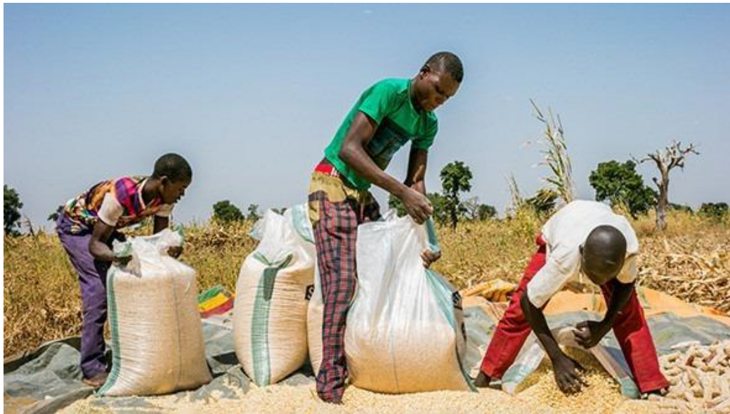
Plate 4: Crude/Manual/Subsistence Post-Harvest Processing on a Farm